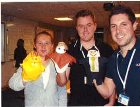
Creativity in Early Years