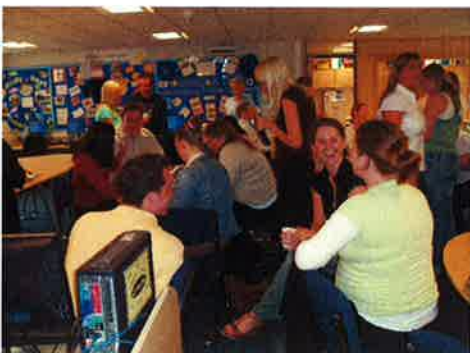
Introductory Day (Old meet New)

Graduates wanting to become teachers should apply in September for the course which will commence in the following year. Qualified Teacher Status and a PGCE (with an option to gain 60 credits towards Masters Level qualification) will be achieved through this course, which is delivered by partnership schools. The SCITT offers a flexible route into teaching based on individual training needs and builds on the vast expertise that exists within the consortium schools. The face-to-face teaching on this course is provided by a team of specialists in the field of initial teacher training.